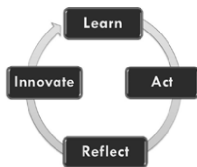
HOBY ACTIVE LEADERSHIP CYCLE

So, stand out and be outstanding! Show us who you are and what you can do. HOBY is your open door to a life of leadership and service. We can't wait to learn what potential you will unlock through HOBY.